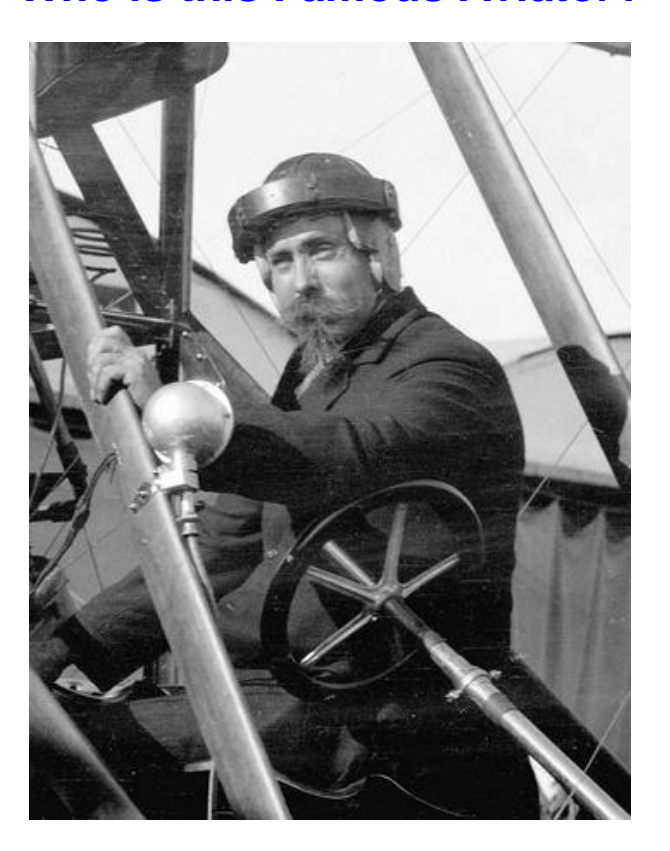
Hint: Is that a KITE???