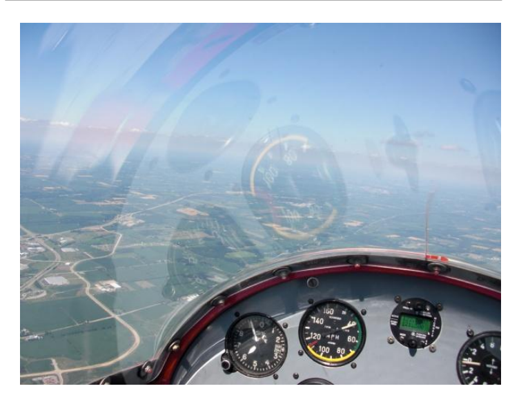
6,000 feet over 44c Beloit Wisconsin 2011 12/5/2011