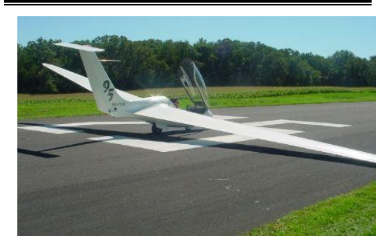
Genesis 2 at Beloit airport Pilot: Curt Lewis (95) 1/1/2007

(Ed – To enter this tracking information, first log into <a href="http://ssa.org">http://ssa.org</a>. Then click on "My Home Page" along the left side of the SSA home web page. Then click on "Profile" near the lower right hand corner of your Home Page. Finally, scroll down to the "Sailplane Information" area and enter your ELT (Spot, ELT, PLB, etc) information.)