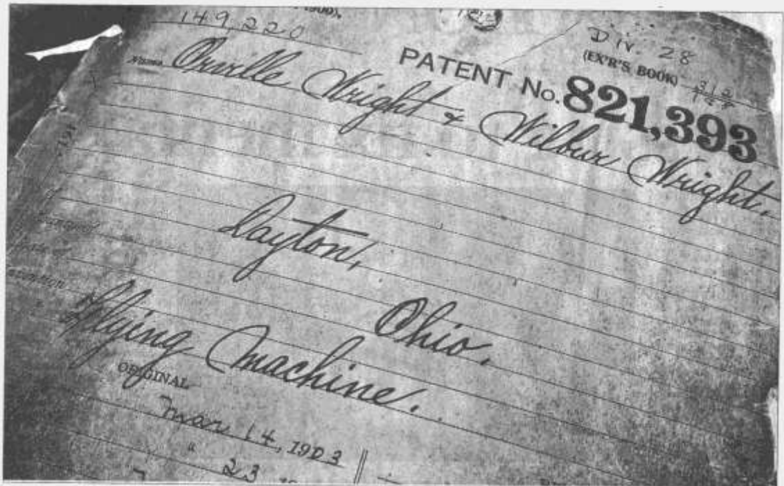
A sleuthing archivist found patent No. 821,393 on March 22 in a special records storage cave in Lenexa, Kan.

Parts of the file are scheduled to be exhibited in the National Archives Museum in Washington starting May