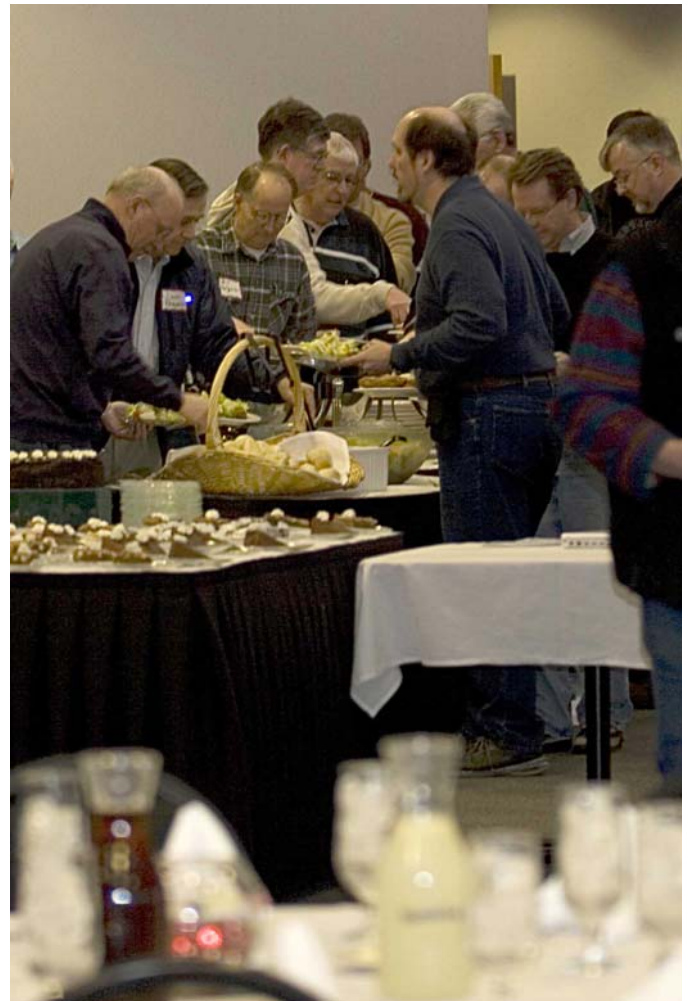
Lunch Time at Elgin Community College

Detailed directions are available at; http://skysoaring.com/modules/gallery/directions