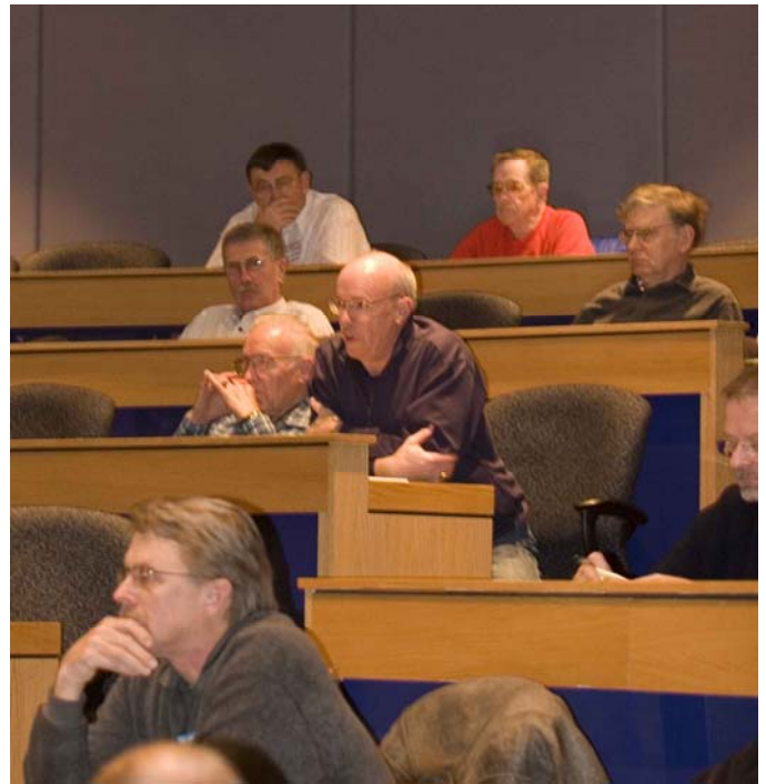
Seminar Attendees Sitting in Rapt Attention

See http://www.ilavhalloffame.org/ for more details.