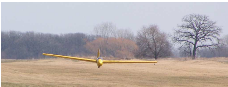
First Flight of the Year March 2009 Sky Soaring

http://www.ilavhalloffame.org http://www.dot.state.il.us/aero/PDF/ILaviation-2009-1Q.pdf