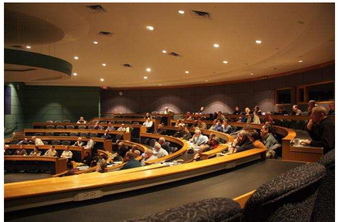
A view of the beautiful ECC Seigle Auditorium, host to the 2009 CLGC Seminar

The 2009 ChicagoLand Glider Council Spring Seminar was a great success. Thanks to the speakers and everyone else that helped.