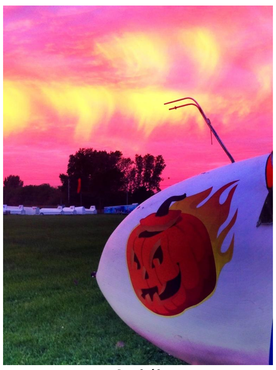
Page 6 of 8