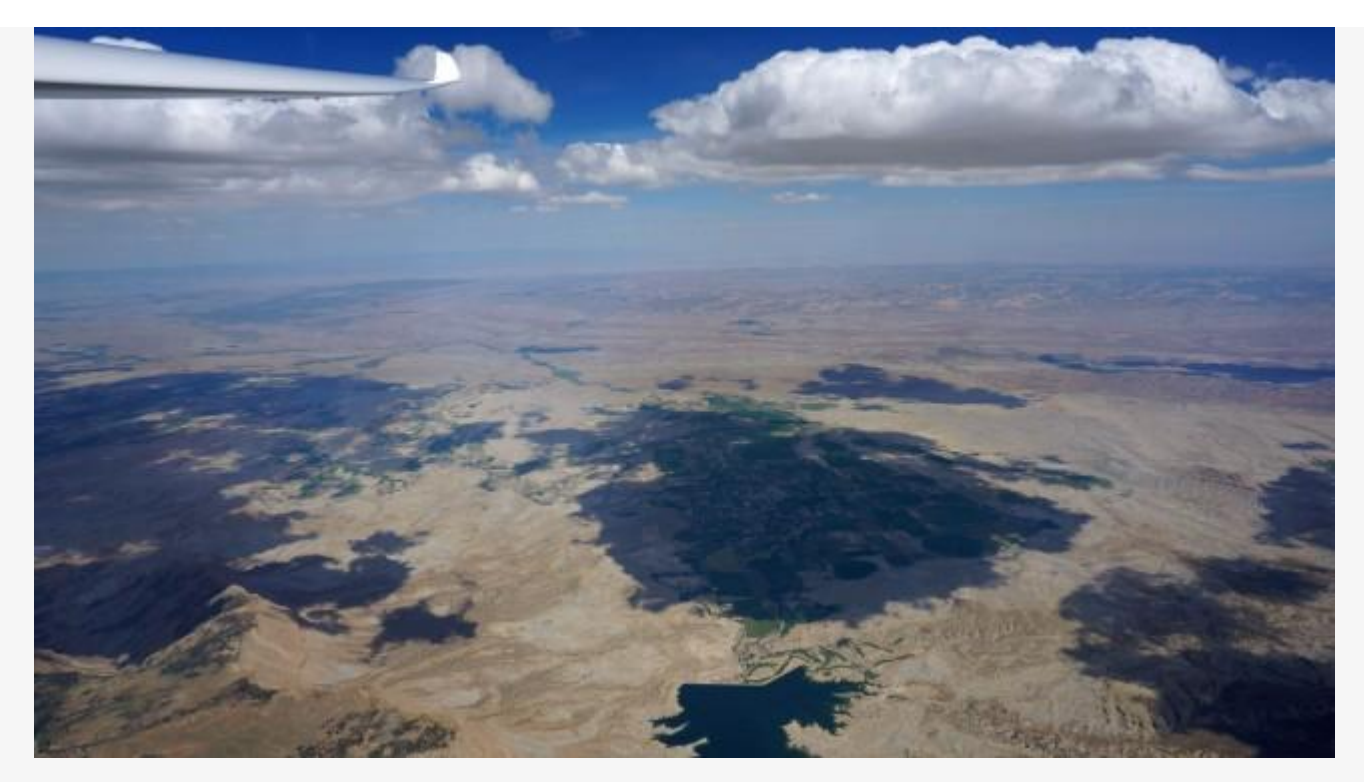
Over Castle Dale UT approaching the Huntington turnpoint, at 17k

Imagine landing after a full day of flying between 15 and 18 k altitude and coming down very pleased with yourself around 7 PM. You tie down the glider, stroll over to the bath house to clean up and walk into the ASA-rented hangar. There, a full catered meal cooked or barbequed by fine local chefs waits for you, complete with refreshments and desert – all for $10 to $15. That routine was kept up throughout the camp, every night! This was one well organized and fun event, my hat comes off to the Board of Directors and the many volunteers of the ASA for pulling this off.