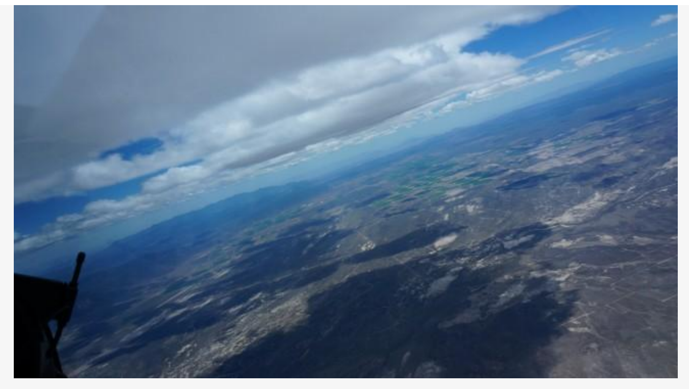
Streeting allows another fast flight

below that mark, the longest around 1,250 km. His turn points included Ely NV, Page AR and Heber City UT. Just like the rest of the group, Thorsten freely shared his substantial insights into the local flying conditions and routes, having attended the camp multiple times.