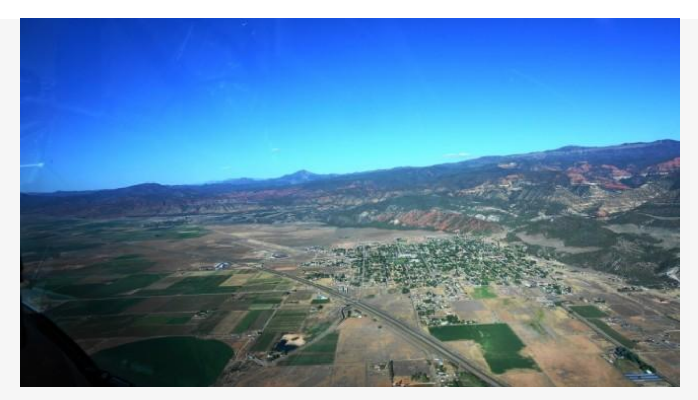
Return to Parowan from the South, seen from ca. 9,000'

Well, did I really deserve this absolutely perfect vacation experience? Of course not, there is nobody watching or doling out rewards and punishment. It all comes down to what few people know is actually Newton's Fourth Law: You Have To Show Up. If you're not taking your chances, if you don't take that tow or make that trip, you'll never know how good or bad it's going to be. So go and make that trip – to Parowan!